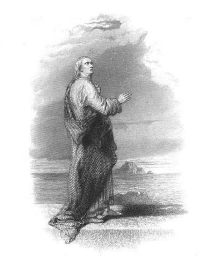
I send it through the boundless vault of stars! The stars, though rich, what dross their gold to thee, Great, good, wise, wonderful, eternal King! (Night 4, 427)

What mean these questions?—Trembling I retract; My prostrate soul adores the present God: Praise I a distant deity? He tunes My voice (if tuned); the nerve, that writes, sustains: Wrapp'd in his being, I resound his praise: But though past all diffused, without a shore, His essence; local is his throne (as meet), To gather the dispersed (as standards call The listed from afar): to fix a point, A central point, collective of his sons, Since finite every nature but his own.