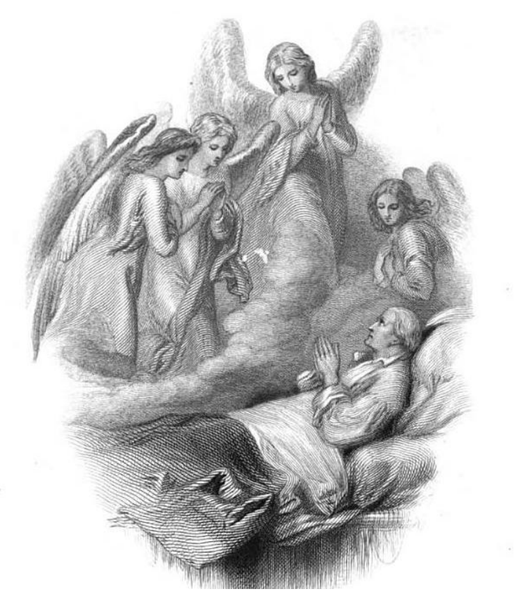
The chamber where the good man meets his fate, Is privileged beyond the common walk Of virtuous life, quite in the verge of heaven. (Night 2, 631)

Whatever farce the boastful hero plays, 650 Virtue alone has majesty in death; And greater still, the more the tyrant frowns. Philander! he severely frown'd on thee. "No warning given! Unceremonious fate! A sudden rush from life's meridian joy! A wrench from all we love! from all we are! A restless bed of pain! a plunge opaque Beyond conjecture! feeble Nature's dread! Strong Reason's shudder at the dark unknown! A sun extinguish'd! a just opening grave! And, oh! the last, last, what? (can words express? 660 Thought reach it?)—the last—silence of a friend!" Where are those horrors, that amazement, where, This hideous group of ills, which singly shock, Demand from man?—I thought him man till now.