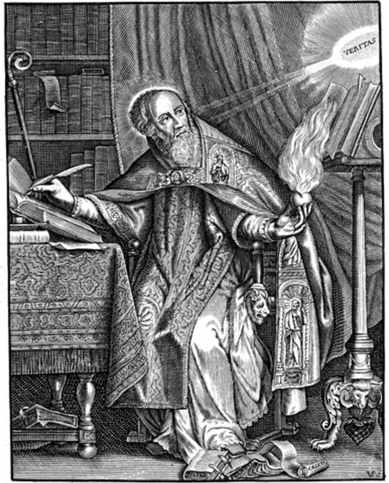
UNDE ARDET, INDE LUCET.